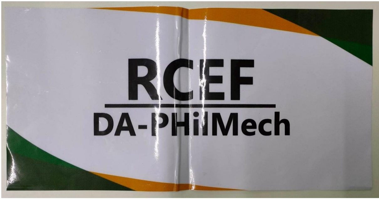
Laminated reflectorized vinyl sticker Sample